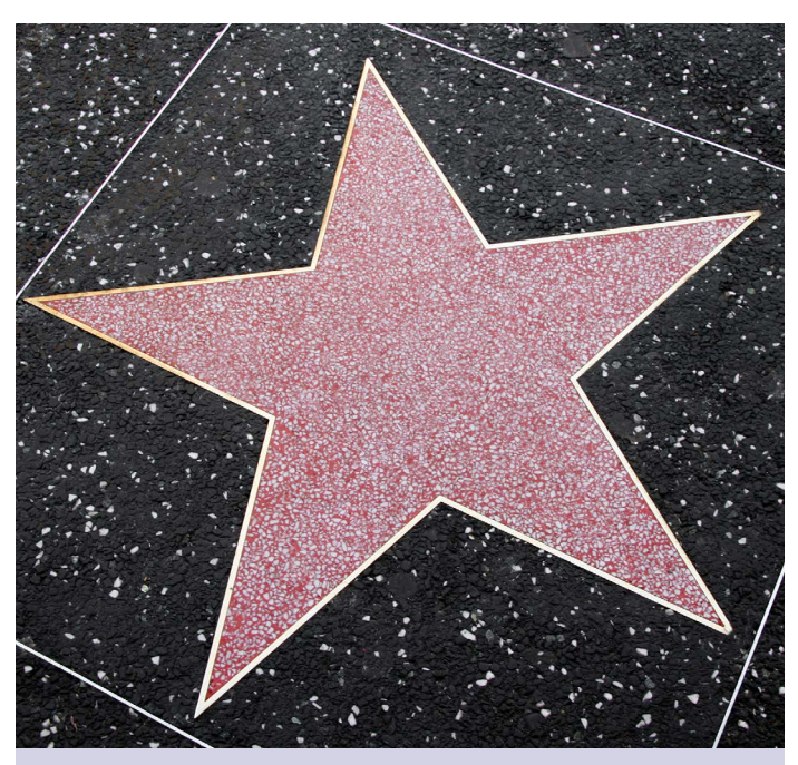
Are you insuring your star client properly?

Loan-out corporations are separate legal entities (corporations or LLCs) whose purpose is to "loan out" the owner of the entity for their services/talent provided. These corporations are almost exclusively owned by a single individual.