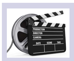
Take1 can help with productions too!

Again, just because an entity has the word "production" in it, or it has a two-second splash at the end of a show, is not a reason to be overly concerned.