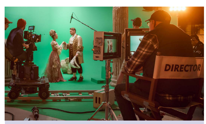
There's a fine line between loan-outs and productions

As stars are generally high-profile individuals, many standard carriers avoid writing personal liability exposures for them, as they tend to attract more liability suits than Joe Q. Public.